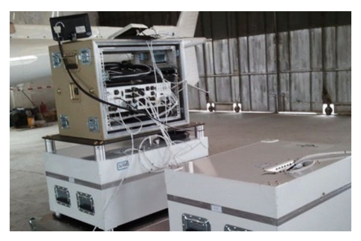
AGRS SYSTEM with 33.6 litres of sensor and equipment rack ready for installation in aircraft

McPHAR's radiometric systems all feature Pico Envirotec's NEW 1024-channels AGRS Advanced Airborne Gammaray Spectrometer and sensors. AGRS is a highly advanced system ideally suited for minerals or environmental applications as the maximum throughput of AGRS can be as high as 250,000 counts per second (cps) per detector. AGRS features automatic HV calibration and linearization based on natural radioactive elements, therefore radioactive sources are NOT required for calibration. As well, AGRS features automatic peak detection and real-time calibration. The full spectrum is recorded at a sample rate of once per second (1024 channels) which permits NASVD processing (using PRAGA-3 software). Typically the data are processed to produce the standard IAEA channels, Total Count, Potassium, Uranium and Thorium. Potassium, equivalent Uranium (eU) and Thorium concentrations are derived, as well, various ratios of these concentrations are computed, which greatly aid in the interpretation of the survey results.