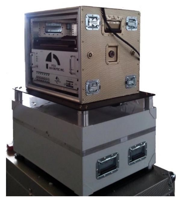
AGRS SYSTEM with 16.8 litres of sensor and equipment rack ready for installation in helicopter

Depending on the application and the airborne platform to be used, the sensor volumes in our AGRS systems range from 16.8 litres of Na(TI) detector to 50.4 litres of detector "downward-looking" with an appropriate volume of sensor "upward-looking". A typical helicopterborne system would have a volume of 16.8 litres "upward-looking" and 4.2 litres "downward-looking", whereas a typical fixed-wing system would have a volume of 33.6 litres "upward-looking" and 8.4 litres "downward-looking".